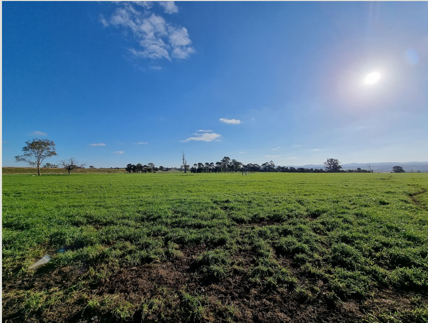
Photo: looking back to mine boundary from R29