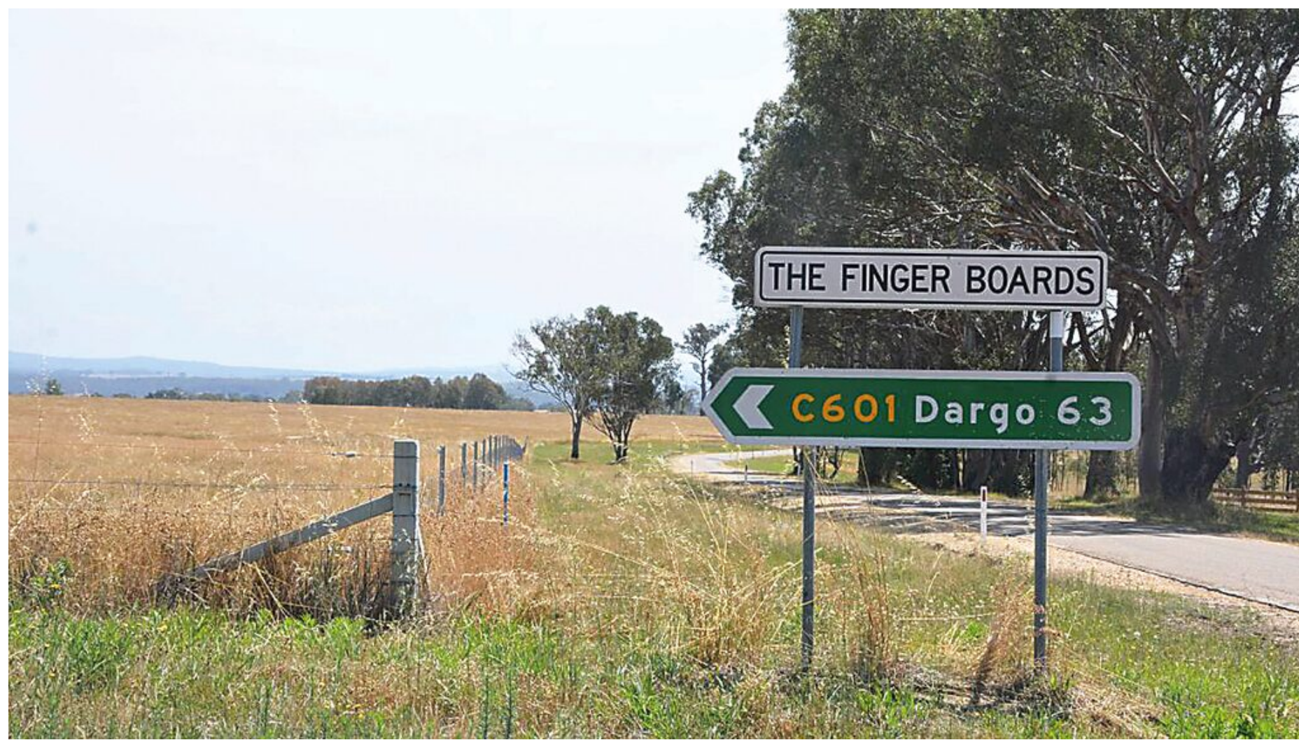
Opponents of the Kalbar Mineral Sands Mine have criticised the company for applying for a mining licence before the completion of the Environmental Effects Statement process.

THE Environmental Effects Statement process for the proposed Fingerboards mineral sands mine at Glenaladale has attracted some community criticism, after the company behind the proposed mine, Kalbar Operations Pty Ltd, applied for a mining licence before the EES completion.